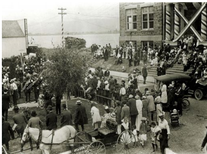
St. Helens, 4 July 1915. A holiday celebration is well attended. The old courthouse steps provide a vantage for viewing the St. Helens Band in the plaza below. Note the old Columbia Theatre with its vertical sign in the background on the left.

Public awareness of the book project encouraged descendants of local families who came here in the 1800s through most of the 1900s to share their histories, and as a result we have much more knowledge about those who helped develop the town's cultural, educational, and economic background. Visitors with boxes of manuscripts, diaries, letters, photos, artifacts, and inquiries hastened the reopening of dusty archives and granted all of us at the CCMA with refresher courses in local history.